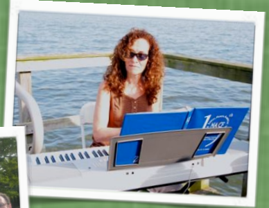
By the River of Hudson we stood up and sang