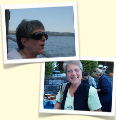
Shirah members show their enthusiasm for singing seen here during an informal concert outdoors in Nyack